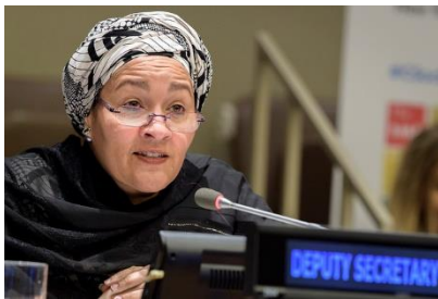
Deputy Secretary General, Amina J. Mohammed.

And they're off! The 56 th Commission on Social Development took off on Monday, January 29 th with a welcome from the Deputy Secretary General, Ms. Amina J. Mohammed. She began her statement by highlighting the progress that has been made since the 1995 World Summit for Social Development, stating the impressive reduction in extreme poverty, major improvements to access to healthcare and education, and the increased practice of creating policies that put people at the center of development. While there has been great progress made, she emphasized the need to build on the achievements of the Millennium Development Goals to fully recognize the 2030 Agenda.