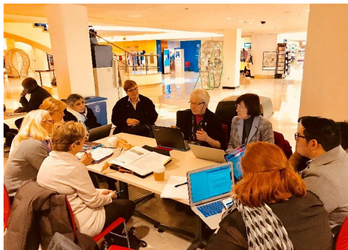
The Grassroots Task force meets in the UN Café in preparation for the CSocD Side event.

outreach and engagement between governments and civil society. An interesting part of the survey asked NGO respondents to rate progress to date in their countries on SDGs 1,2,3,5,9,14 and 17. This assessment yielded missed results. The most common response was that “a little progress” had been made. In some cases, however, NGO respondents believed that situations had worsened. The most negative assessment was on Goal 14 on water and oceans. The table is reproduced here.