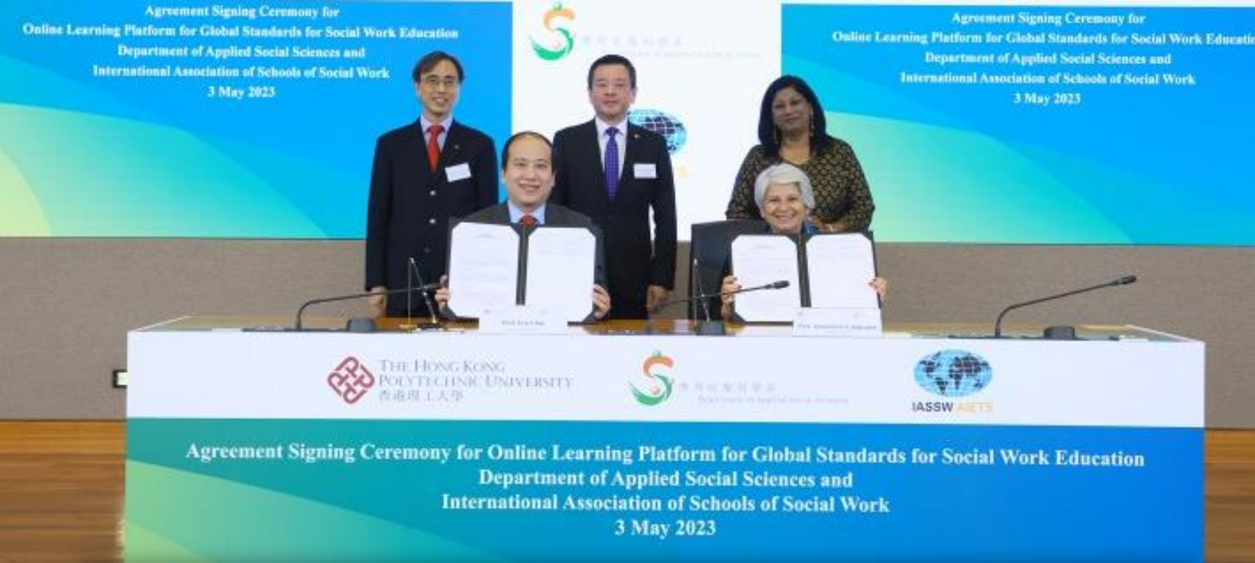
Agreement signing between APSS, PolyU and IASSW 3 rd May 2023